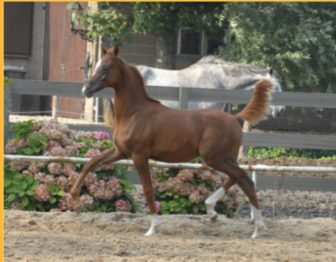
Ter Waele Hamir showing off his paces.

me, Ter Waele Hayat (by Aja Shakakhan by FS Bengali). At the moment Ter Waele Hayat looks very promising, but