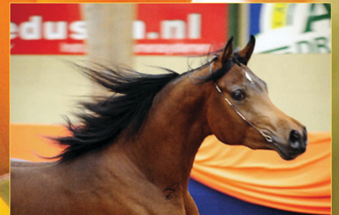
Ter Waele Hamadin.

Ter Waele Hamidah stayed with us and turned out to be a very beautiful mare, winning a lot in the show-ring and she is now my most valuable broodmare. She is known for her elastic movement and beautiful confirmation, including a lovely head and expression denoting her intelligence, grace and beauty. I have always loved my mares with a high percentage of Crabbet/Blunt breeding. However, I realised that if I wanted to keep on showing my mares and stallions with success, I had to outcross to other bloodlines as well. Though our continuing objective shall be to produce Arabians that perform well in the European show-ring, they must also possess a strong willingness to work under saddle. Our next generation will utilise a stallion of impeccable conformation, movement and attitude, yet bringing a lower percentage of Crabbet and Old English blood than we have typically bred for in the past. We believe this outcross will bring excellent results and enhance future breedings back to our foundation stock. I will always have a strong desire to incorporate the best Crabbet/Old English stallions back into my bloodlines.