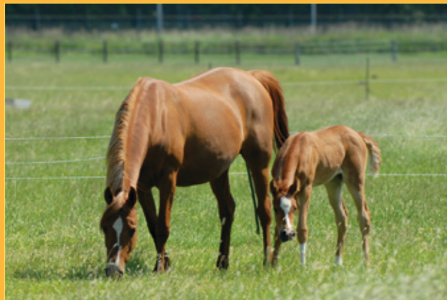
Hamidah and Hayat grazing.

ultimately I will have to wait and see how she develops. Hamidah will be taking a break from motherhood in 2009. I am planning to breed her again in 2010, but at the moment I am still trying to decide on the best match. So unfortunately, there will be no Arabian foal at Ter Waele in 2010. However, I am eagerly anticipating a foal from my Holsteiner mare, Vierette BD, who is in foal to the Holsteiner stallion Chin Champ of the