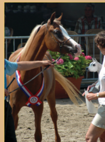
Ter Waele Hanan Champion Junior Mare.

from it. This is a task made much more difficult by a more limited gene pool. In my opinion, there should be more testing and certifying stock for disease by inheritance such as SCID. Naturally, large studs are of great importance to the breed's survival, but genetic diversity plays an important roll as well. In recent years, I have noticed an increasing bottleneck in the number of influential breeders and agents that seem to set breed trends, affecting almost everything from type, breeding selection and purchases, to the fashion of the show-ring. All of this makes me wonder if things are really going in a wise direction. I hope that the future holds a place for small hobby breeders and pleasure riding enthusiasts alike.