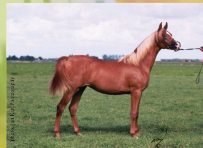
Ter Waele Hamidah in September 2001.