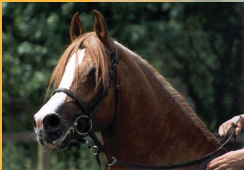
A head study of El Saleem, August 1999.

that same year. Haturanda produced many good foals over the years sired by several pure-bred stallions tracing back to Crabbet and Old English bloodlines. Quite a few of her offspring did well in endurance and the colt, Ter Waele Robin was also raced by his owners. After the first foals, we decided that all