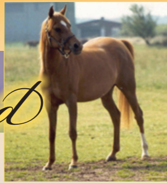
Ter Waele Hazel.

the family did not want to be involved in breeding horses anymore and the stud was registered entirely as my own. Ter Waele Hasty did well in the show-ring and under saddle. In 1999 she was bred in the UK to El Saleem (by Maleik El Kheil) and produced our beautiful mare, Ter Waele Hamidah. Later, Hasty was sold to the UK to an endurance home. She excelled in competition and served as a valuable producer including a lovely filly by multiple-champion Dervatiw Gwyddion (AJ Ibn Negativ x Dervona by Derwisz).