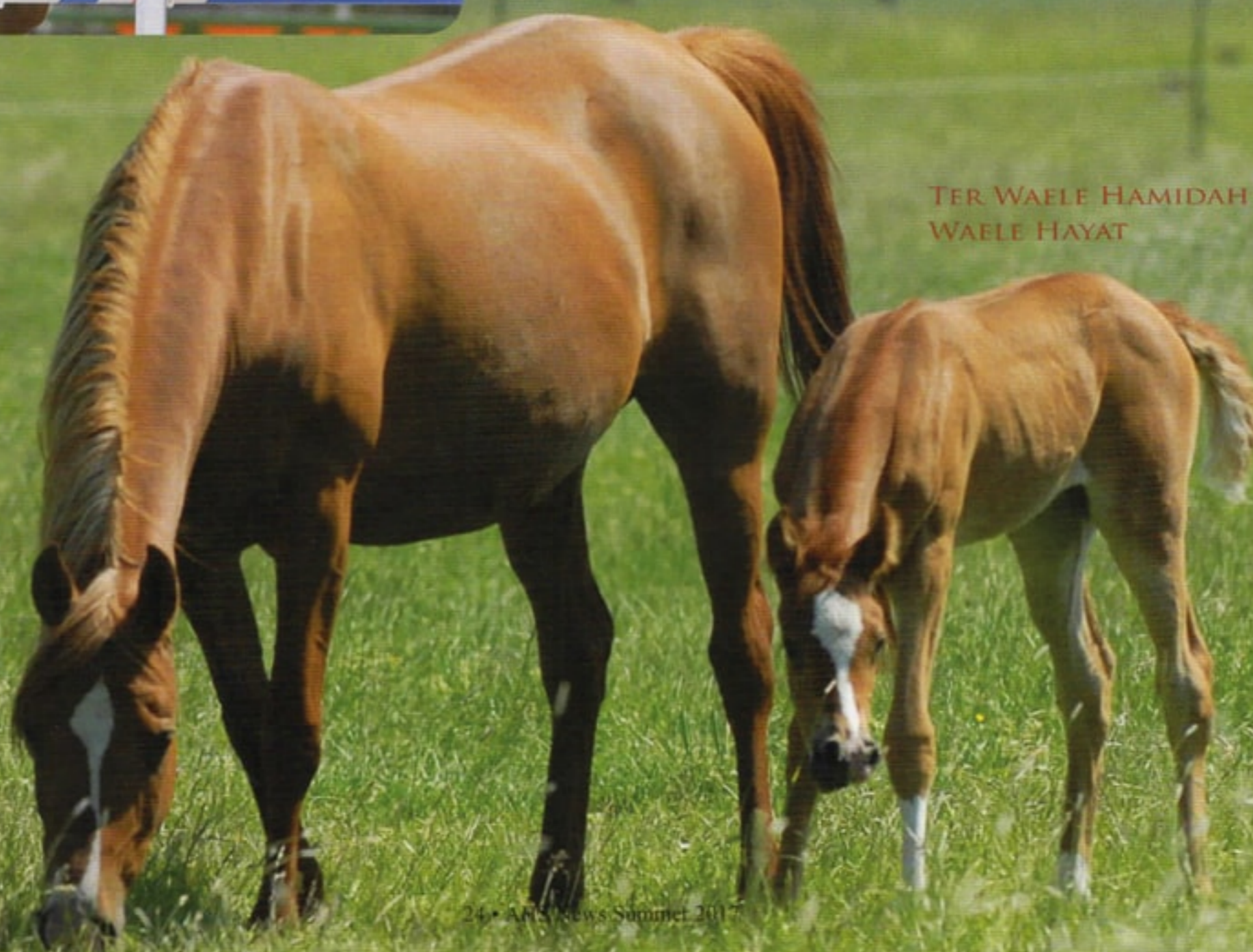
TER WAELE HAMIDAH AND TER WAELE HAYAT